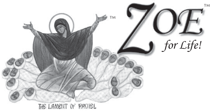
THE LAMENT OF RACHEL