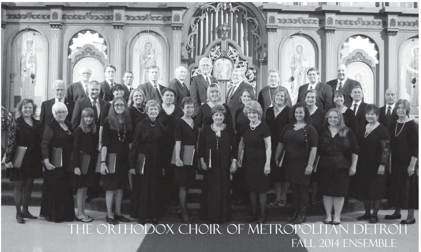
THE ORTHODOX CHOIR OF METROPOLITAN DETROIT FALL 2014 ENSEMBLE