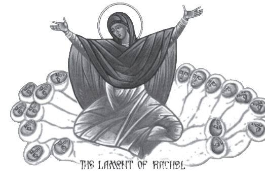
Volume 4 Issue 1 ~ Spring 2005