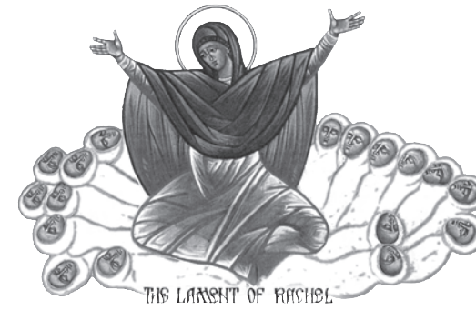
Volume 4 Issue 1 ~ Spring 2005