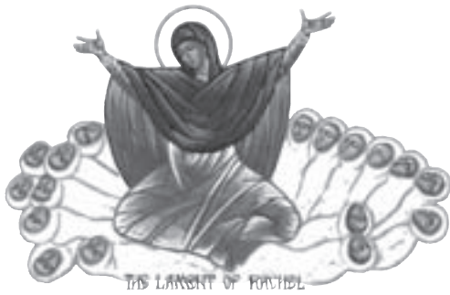
THE LAMENT OF RACHEL